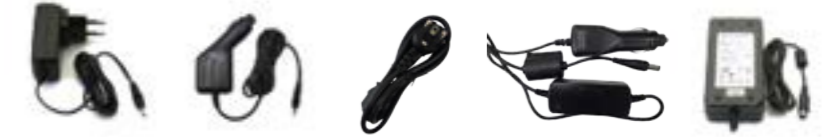
Charger Car charger AC cord Car charger SMPS