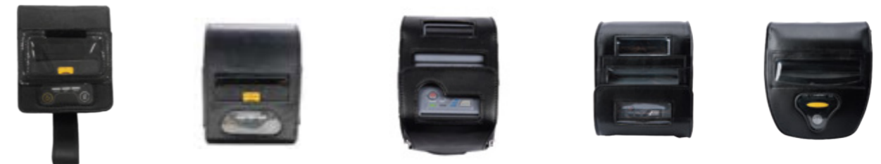
LK-P25II (IP 54 Case) LK-P25II LK-P20II LK-P30II LK-P41