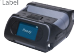
LK-P43II 4" Receipt / Label