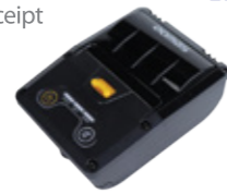
LK-P25II 2" Receipt