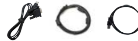
Serial Cable USB A-mini Type USB C Type